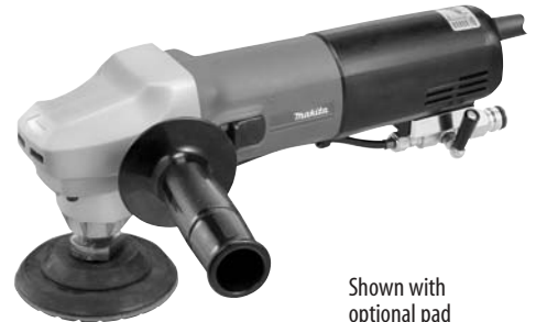
Shown with optional pad