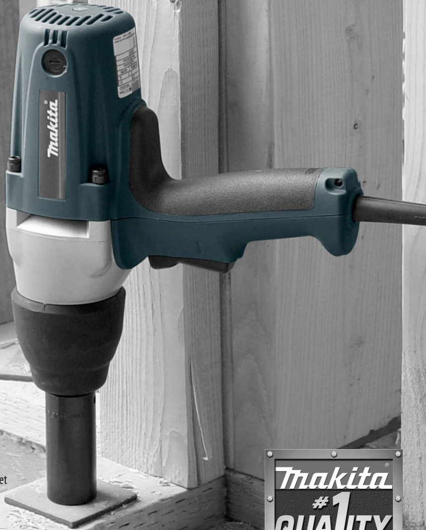
Shown with optional socket

Ideal for Framers, Anchor Setters, Deck Builders, Installers, Automotive Mechanics, Dismantlers, and Many Other Applications